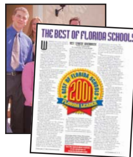
Article on following page(s)

Full color, glossy reprints of any Student Leader or Florida Leader article are available. Give copies to group members, order for media relations, display in admissions offices and send in admissions mailings, as gifts for family members, or an impressive addition to resumes.